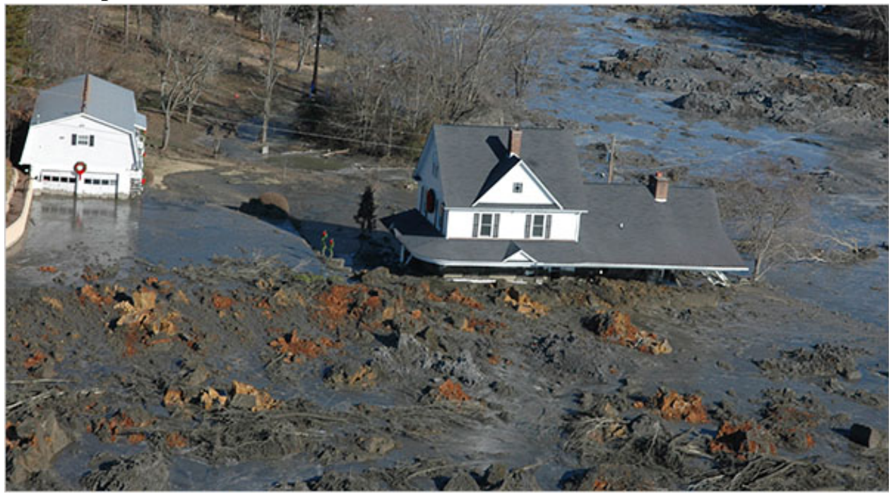
15 homes like this one in Harriman, TN were flooded with fly ash sludge on Monday after a storage pond wall broke

New York Times, December 24, 2008 -- KINGSTON, Tenn. — What may be the nation's largest spill of coal ash lay thick and largely untouched over hundreds of acres of land and waterways Wednesday after a dam broke this week, as officials and environmentalists argued over its potential toxicity.