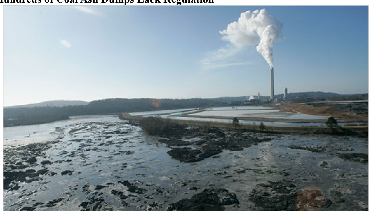
Three hundred acres were covered with toxic sludge in late December when a wall of a coal ash holding pond near Kingston in East Tennessee gave way.

New York Times, January 6, 2009 -- The coal ash pond that ruptured and sent a billion gallons of toxic sludge across 300 acres of East Tennessee last month was only one of more than 1,300 similar dumps across the United States — most of them unregulated and unmonitored — that contain billions more gallons of fly ash and other byproducts of burning coal.